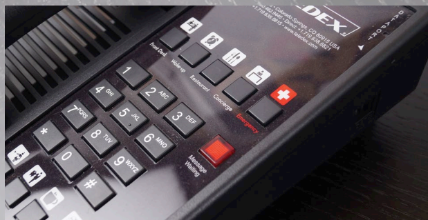
OneTouch voice mail retrieval.