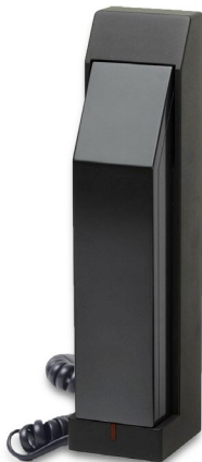
Matching trimline available.

Choose single or two-line corded, cordless, analog, or VoIP configurations.