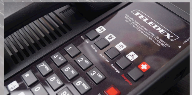
Up to 10 guest service keys.