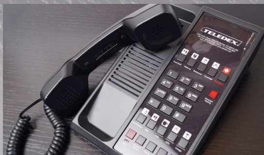
Classic K-style handset.