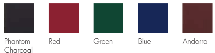
Phantom Charcoal Red Green Blue Andorra